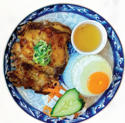
Grilled Lemongrass Chicken On Rice Fried Egg, Pickled Veggies, Side Soup $23