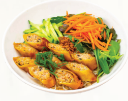
Pork And Shrimp Spring Rolls Noodle Salad Noodle, Veggies, Cucumber, Pickled Carrot, Peanut, House Dressing $23