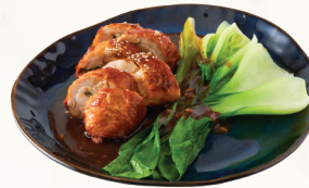
Master Chicken Boneless chicken, Bokchoi, Oyster sauce $25.5