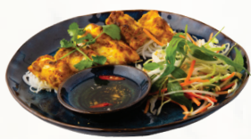
Cha Ca La Vong (Market Fish) Hanoi style pan-fried tumeric fish, Galangal, Spring Onion. Served with Rice Noodle, Salad $29