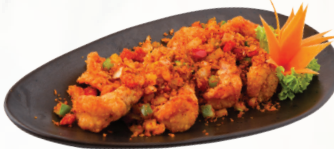
Salted Chilli Prawns King Prawns, Chilli Pepper, Shrimp Salt $28