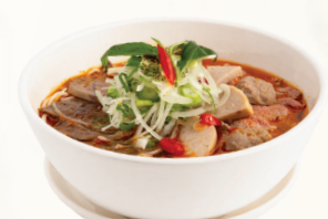
Bun Bo Hue - Spicy Beef Noodle Soup $25