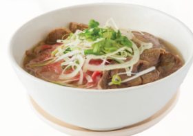
Phở - Beef Noodle Soup $23.5