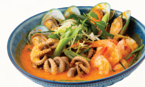
Coconut Seafood Soup Mussels, Squids, Prawns Coconut, Tomyum Soup. Served with Rice. $27.5