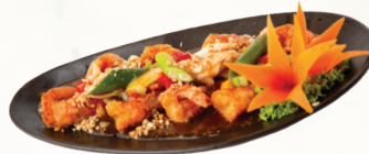
Tamarind Prawn Sweet 'n' Sour Tamarind Sauce, Peanut, Spring Onion $28