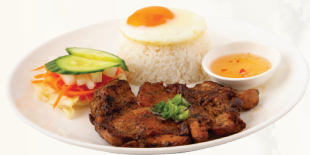
Grilled Lemongrass Pork On Rice Fried Egg, Pickled Veggies, Side Soup $23