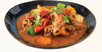
Sautéed Beef With Xo Sauce Capsicums, Onion $26