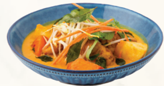
Mekong Yellow Chicken Curry Kumara, Potato, Curry Leaves Served with Rice $26.5