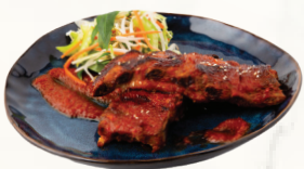
Sticky Pork Spare Ribs BBQ Sauce, Side Salad $27