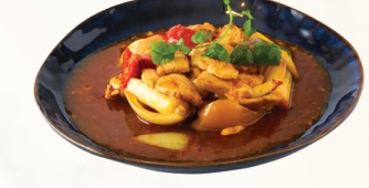
Sautéed Chicken With Sambal Sauce Capsicums, Onion $24.5