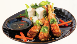
Grilled Pork & Shrimp On Lemongrass Sticks Peanut, Fresh Spring Rolls $26.5