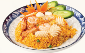
Seafood Fried Rice Assorted Seafood, Carrot, Beans $26