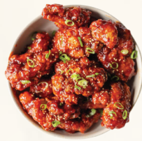
Spicy Sticky Boneless Chicken $16

Rice Noodle, Veggies, Peanut Choice of: Prawn, Chicken, Pork, Tofu