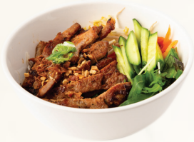
Lemongrass Chicken/Pork Noodle Salad Noodles, Veggies, Cucumber, Peanut, Pickled Carrots, House Dressing $23