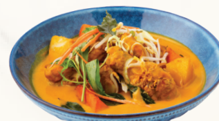
Saigon Yellow Fish Curry Capsicums, Onion, Curry Leaves Served with Rice $28.5