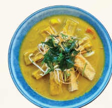
Vegetarian Curry Kumara, Potato, Curry leaves, Tofu Served with Rice $25