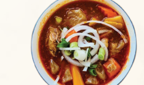
Five-Spice Braised Beef Stew Carrot, Potato, Onion. Served with hot bread $25