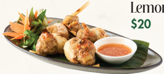
Grilled Of Mixed Snails & Pork With Lemongrass, Herb $20