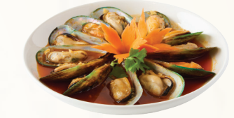
Green Mussels With Garlic Butter Sauce $26