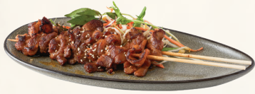
Grilled Pork Skewers Sambal sauce, salad $15.5