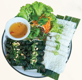
Marinated Grilled Beef Wrapped With Betal Leaf Served with Rice Noodle, Salad $26.5